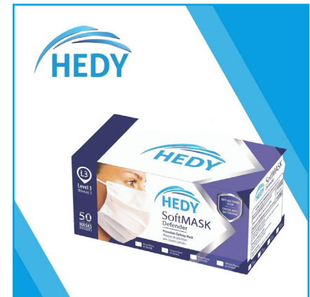
Hedy Soft Mask