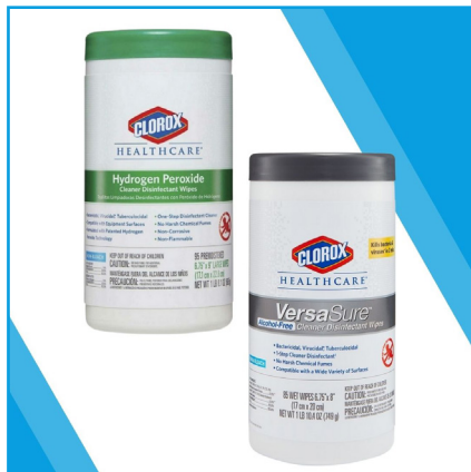
Clorox Disinfectant Wipes