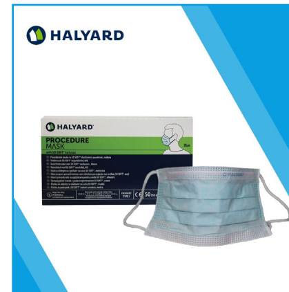
Halyard Earloop Procedure Mask