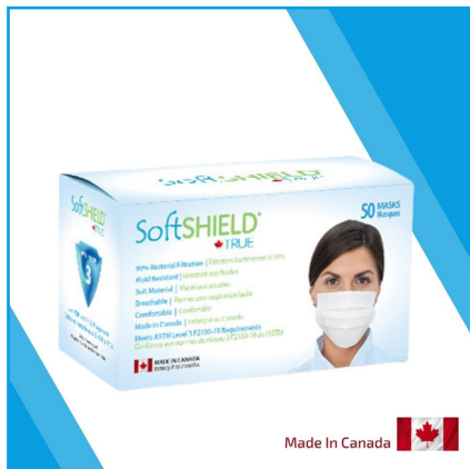
AdvanCheck SoftSHIELD TRUE Level 3 Procedure Mask