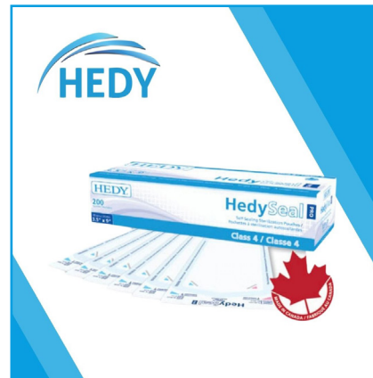
Medicom/Hedy Hedyseal Pro Class 4 Self Sealing Sterilization