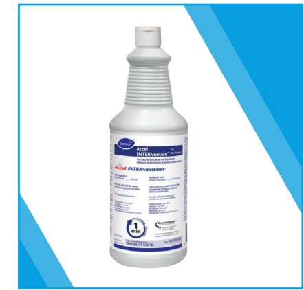
Accel Intervention Ready to use Solution - 1 litre bottle