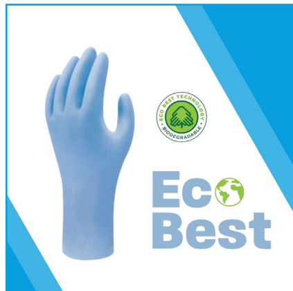
EcoBest Biodegradable Gloves